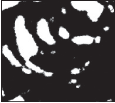
Extreme close-up (ECU) Construct significance.