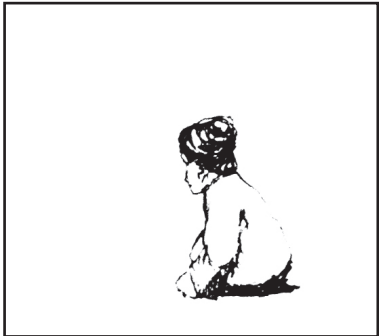
Full shot (FS) Body language sets mood.