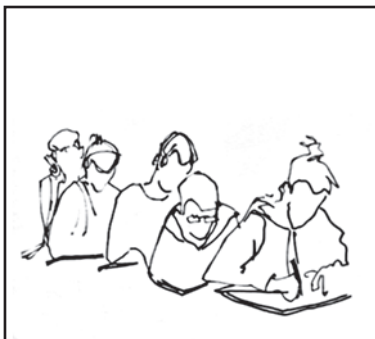
Pan - Move the camera from right to left to extend the field of view.