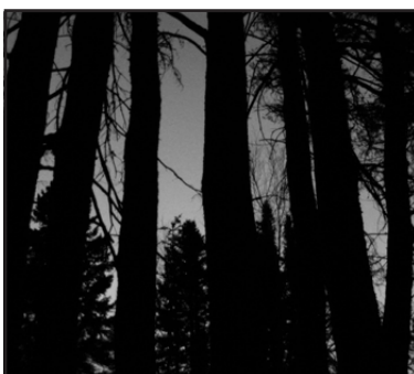
Low angle Suggests strength.