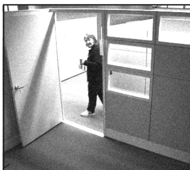
High angle Suggests weakness.