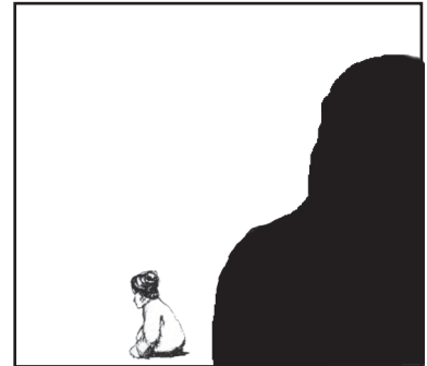
Over-the-shoulder (OTS) Explore points of view.