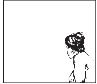
Medium shot (MS) Measure compositional weight.