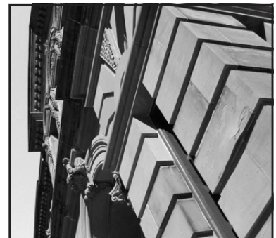
Tilt - Tilt camera up or down on the tripod to alter field of view.