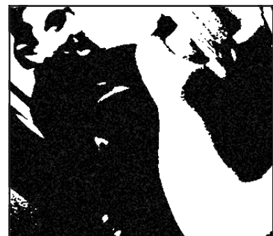
Canted angle Suggests uncertainty.