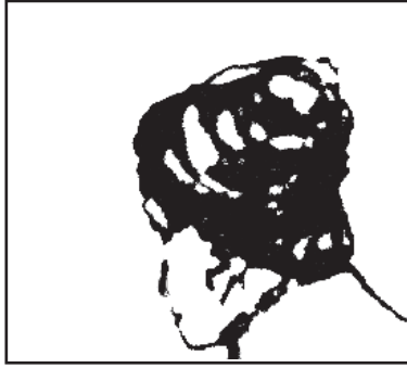
Close-up (CU) Feature details of character.